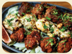
A huge mixed platter of tandoori monkfish, lamb and chicken.